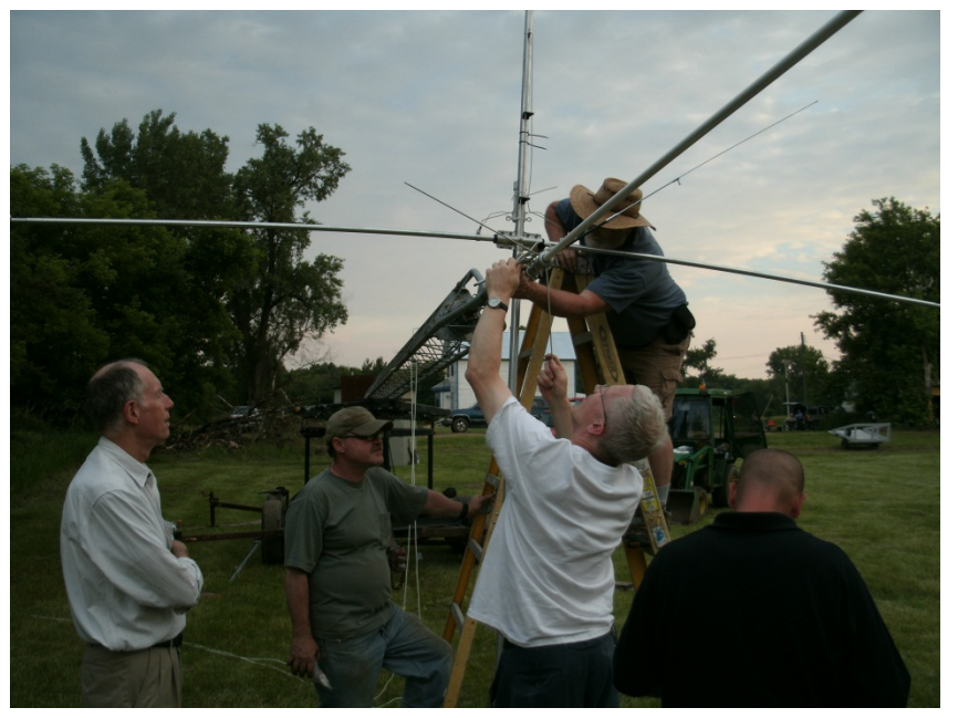
Field Day 2011 volunteers assemble an antenna in preparation for the field day event.

Sunday June 24th, Noon: Field Day Operations End. Once the Field Day has been completed, the N3FJP software logs will be backed up several times for safe keeping. All the equipment will need to be taken down and made ready to their transport back to original locations. Subway Sandwiches will available for any / all members that stay to tear-down. (sponsored by KC0LQL).